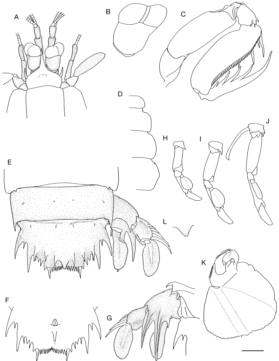
FIG. 2. — Kasim karubar n. sp., holotype (MNHN); A , anterior cephalon, dorsal; B , eye, right dorsal; C , raptorial claw, right lateral; D , TS5-8, right dorsal; E , AS5-6, telson and uropod, dorsal; F , telson, ventral; G , uropod, right ventral; H-J , pereiopods 1-3, right posterior; K , PLP1 endopod, right anterior; L , TS8 sternal keel, right lateral. Scale bar: A-J, 1.25 mm; K, L, 0.6 mm.