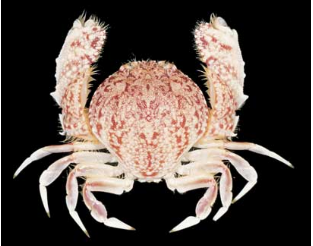
FIG. 2. — Cycloes marisrubri Galil & Clark, 1996, ♀ cl 39.3 mm, Nuku Hiva I., stn DW 1170, 8°45.1'S, 140°13.1'W, 104-109 m, 25.VIII.1997 (MNHN B27619), dorsal view.

7 juv. (MNHN B27598). — Stn DW 1235, 9°42'S, 139°03'W, 105-285 m, 31.VIII.1997, 2 juv. (MNHN B27599).