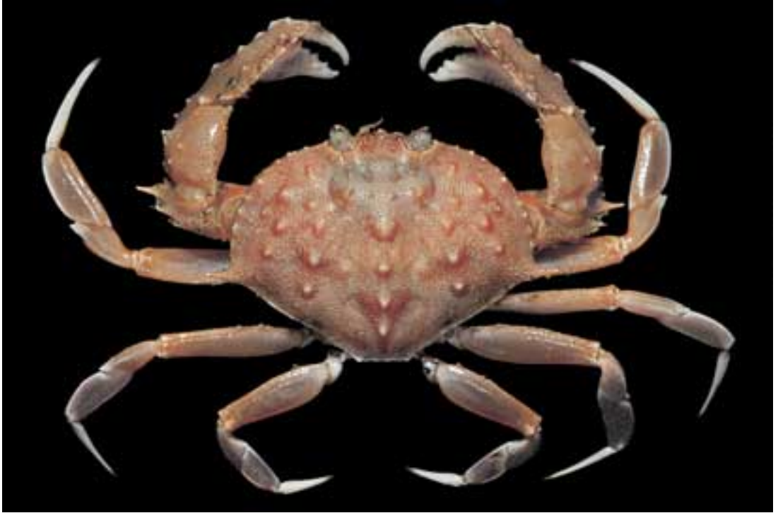
FIG. 4. — Mursia poupini n. sp., ♂ holotype, cl 41.0 mm, Dumont d'Urville Plateau, stn CP 1251, 9°47'S, 139°38'W, 500-650 m, 2.IX.1997 (MNHN B27632), dorsal view.

ETYMOLOGY.— Named in honor of Joseph Poupin, in appreciation for his role in exploring the decapod fauna of French Polynesia.