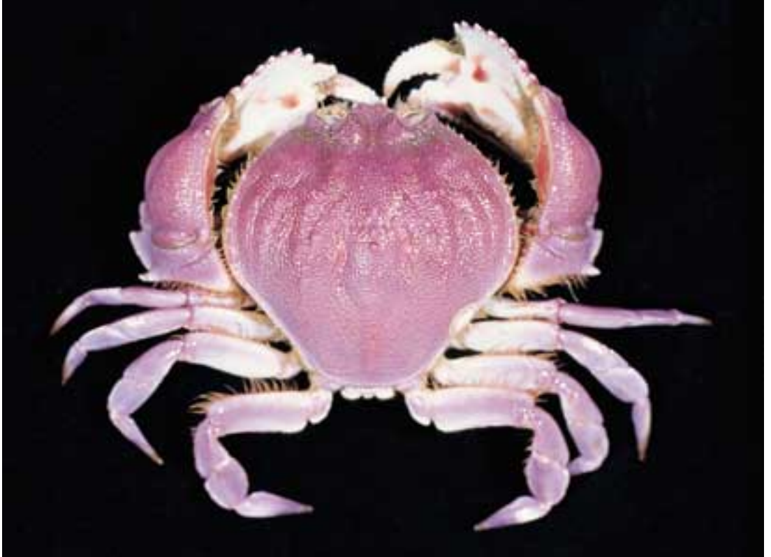
FIG. 1. — Cycloes marisrubri Galil & Clark, 1996, ♂ cl 37.7 mm, Nuku Hiva I., stn CP 1188, 8°48.6'S, 140°03.4'W, 35-55 m, 26.VIII.1997 (MNHN B27623), dorsal view.

MATERIAL EXAMINED. — Eiao I. Stn CP 1160, 7°57.8'S, 140°02.0'W, 49-55 m, 23.VIII.1997, 1 ♂ cl 29.9 mm, 1 ovigerous ♀ cl 37.2 mm (MNHN B27584).