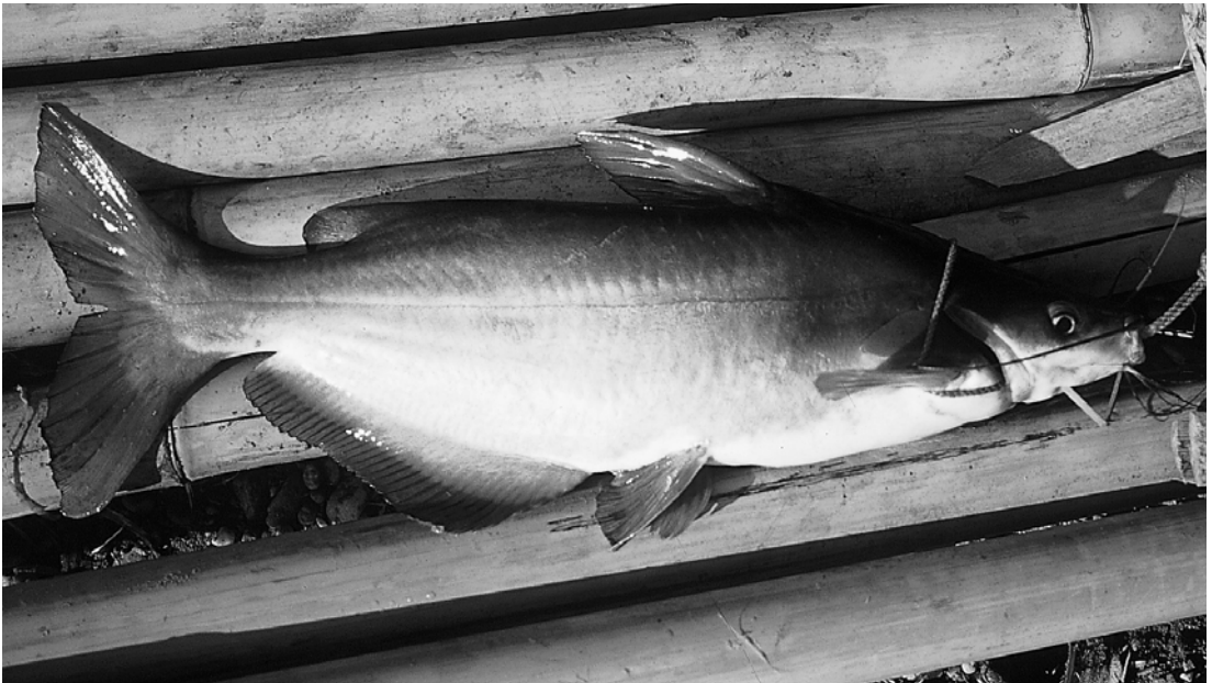
FIG. 1. — Cranoglanis henrici , about 350 mm SL, Vietnam, Tuyen Quang Province, Song Lo basin, Song Gam at Chiem Hoa, 25.X.1999.

Nanning. Guangxi Province, China, 1 ex. 79.7 mm SL (NRM 10399).