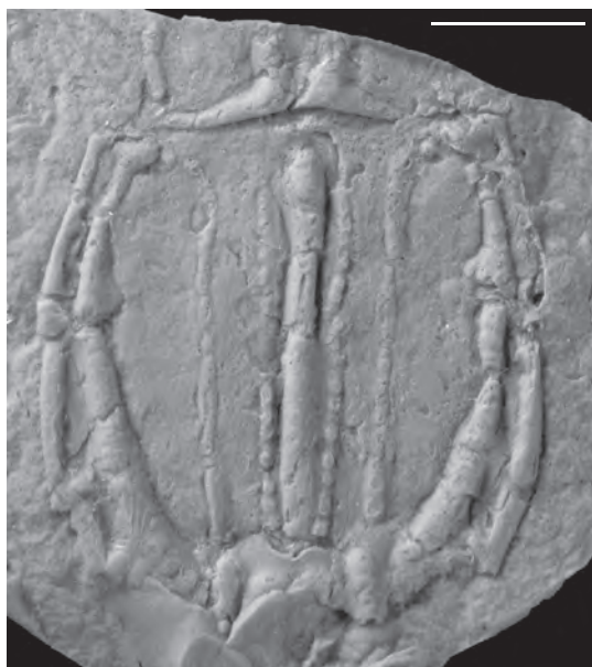
FIG. 3. — Fossil Stomatopoda from Monségur (Gironde, France), Ursquilla yehoachi (Remy & Avnimelech, 1955), cast of holotype, MNHN R62691. Scale bar: 1 cm.

TYPE LOCALITY. — Probable Eocene rocks on the sea-cliff below Laga-Ghirobo hill, near Fresco, Ivory Coast, Africa (Remy 1960).