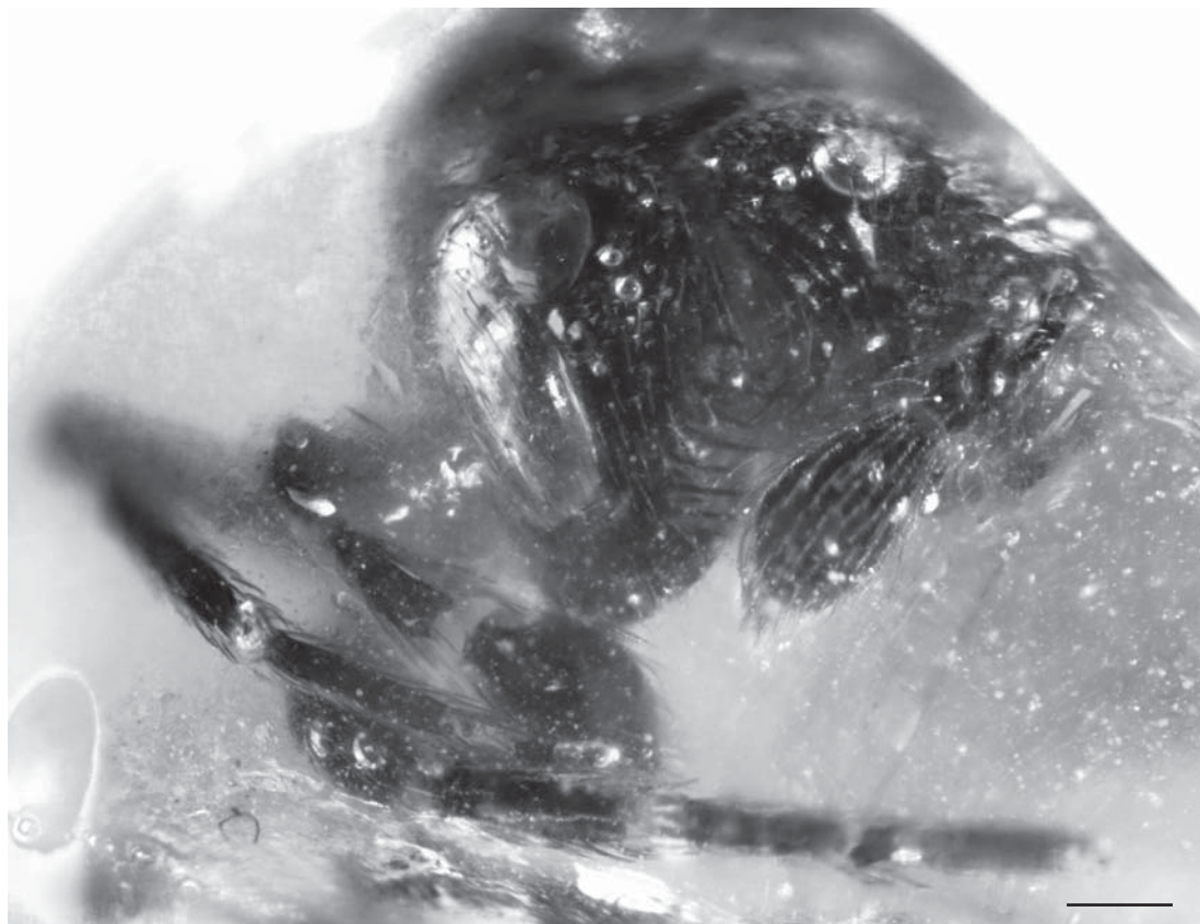
FIG. 3. — Archaemecys arcantiensis n. gen., n. sp., anterior view of the chelicerae and pedipalps. Notice the peg teeth on the chelicerae and the heightened profile of the carapace. Scale bar: 0.1 mm.

from a lack of informative characters used in the analysis and because we were dealing with family-level data that is possibly unnatural. For example, the tendency to lose spinnerets is prevalent within the Palpimanoidea: Palpimanidae, Stenochilidae, Huttoniidae and Mecysmaucheniidae all have a reduced number (Forster & Platnick 1984), but the Archaeidae (sister to the Mecysmaucheniidae and phylogenetically removed from many of the previously cited taxa) still retain the primitive six. It is important to note that the mecysmaucheniids are diagnosed by the combined characters of having only two spinnerets (a character present in other palpimanoid families) and chelicerae originating from a foramen in the carapace. The mosaic of characters found in palpimanoid taxa is reflected in