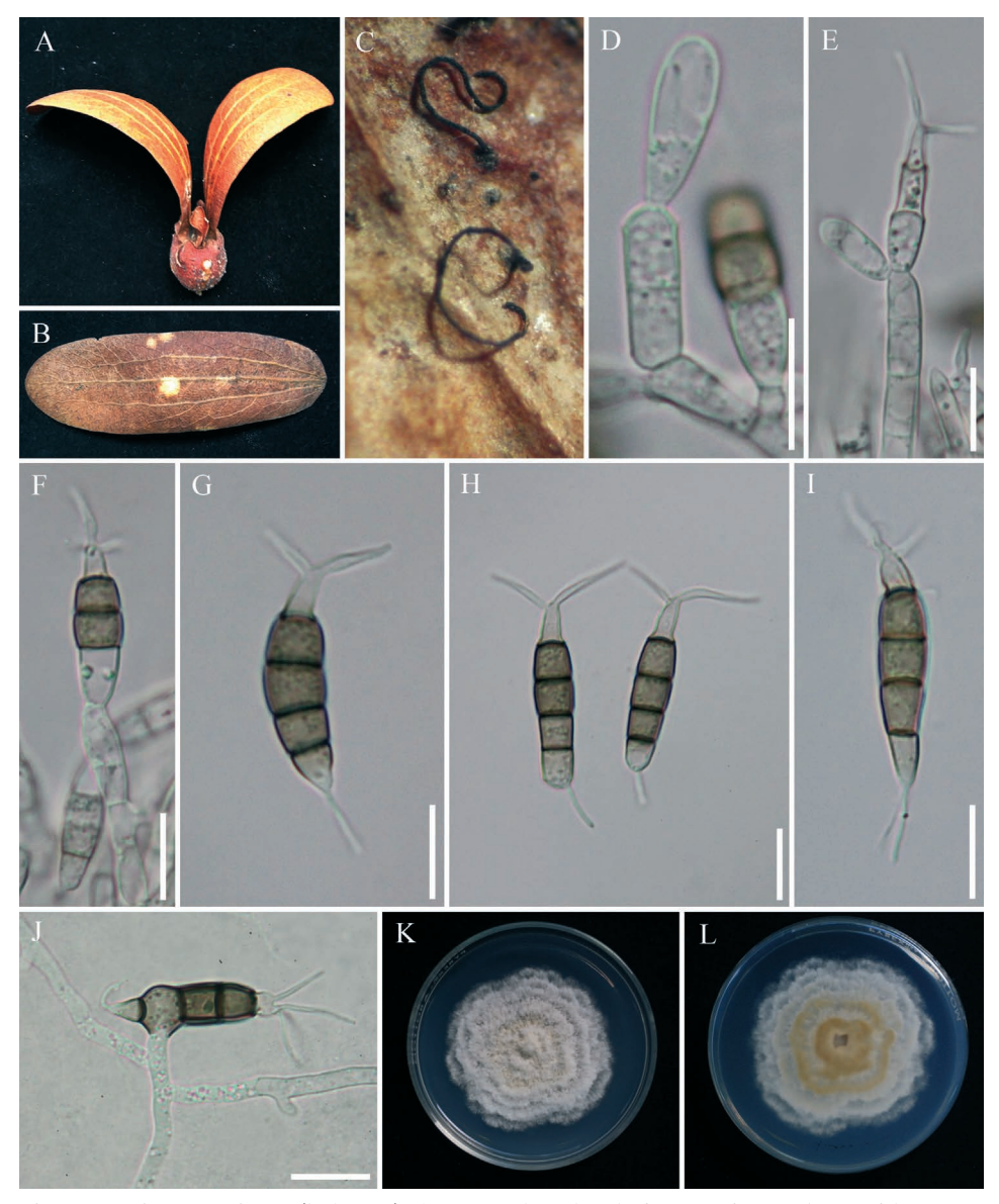
Fig. 2. Pestalotiopsis shorea (holotype). A. B. Dead seed and wings of Shorea obtusa with fungus. C. Acervuli (Conidia coming in cirrus from pycnidia). D-F. Conidiogenous cells. G-I. Conidia. J. Germinating conidium. K. L. Colony on PDA, K. from above, L. from reverse. Scale bars: D-J = 10 \mu m .

Distribution and habitat : on dead wing of seed of Shorea obtusa , Chiang Mai Province, Thailand.