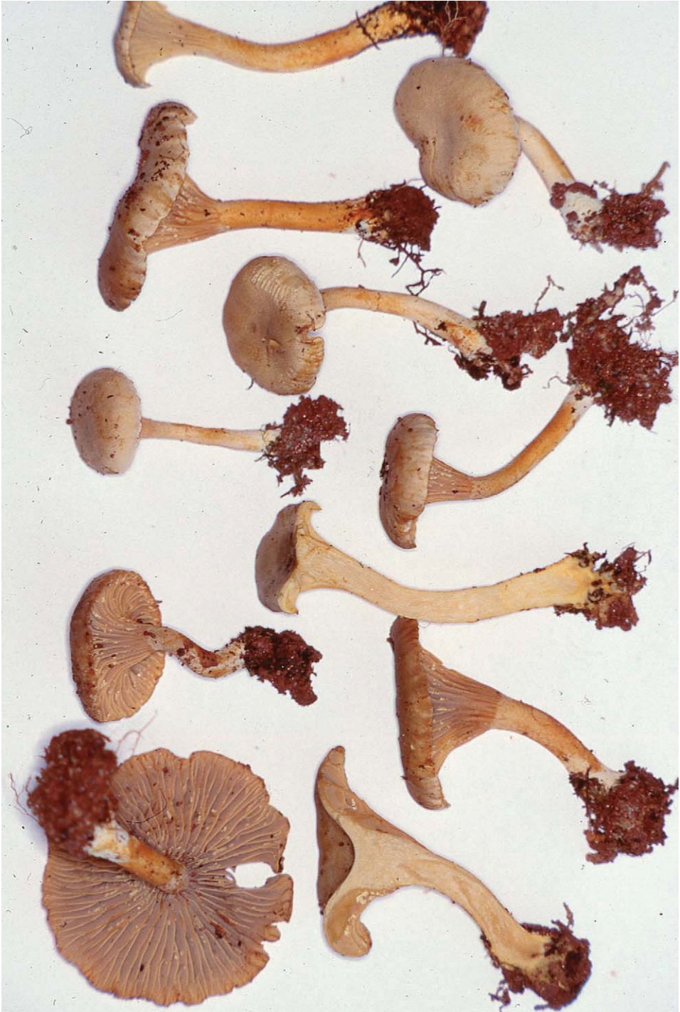
Fig. 4. Cantharellus eysartierii sp. nov. (holotype).