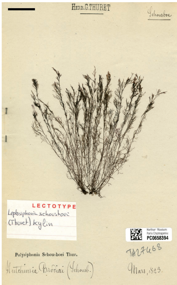
Fig. 1. Lectotype specimen of Polysiphonia schousboei (PC0658394). Scale bar: 2 cm.