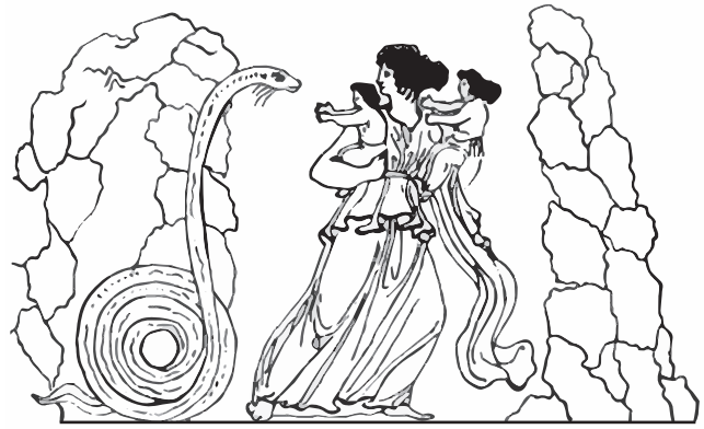
FIG. 1. — The Python's cave ( antron ). Leto escapes from Python with Apollo and Artemis in her arms. Lost Apulian red-figure neck amphora, earlier IV BC, drawing by J. H. W. Tischbein after Ogden (2013a: 39, fig. 3).

There are also extant anecdotes about snakes allegedly pestering specific people. Pliny claimed that snakes move in pairs, and when one of them is killed by a human, the other chases the human in revenge "bursting through all