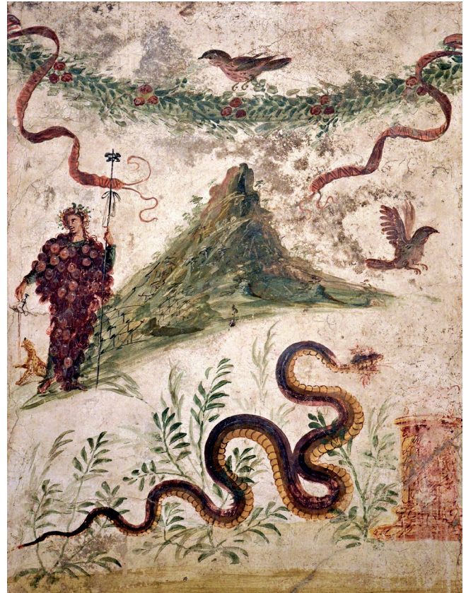
FIG. 2. — Bacchus and Vesuvius. A huge snake is slithering in front of an altar. Pompeii, from the Lararium of the House of the Centenary, 55-79 AD, Naples. National Archaeological Museum, inv. 112286, after Kuivalainen (2021: 117, C17).

As Tadić recently concludes, snakes “constantly suffer from “taxonomic chauvinism” [...] or, simply speaking, plain disparagement” (Tadić 2023: 96). It was different in ancient times. The belief that an encounter with the snake was supernatural and never accidental motivated observations of the reptile’s behaviour and the attempts to read its intentions. The ancients had many occasions to learn about the behaviour of the reptile and to draw conclusions about the potential of its memory, based on their observations. Greek and Roman accounts presented the snake as an animal that had achieved great reproductive success and spread throughout the world. There were only some places that were free, or almost free of snakes, but it was due to the intervention of the gods and heroes.