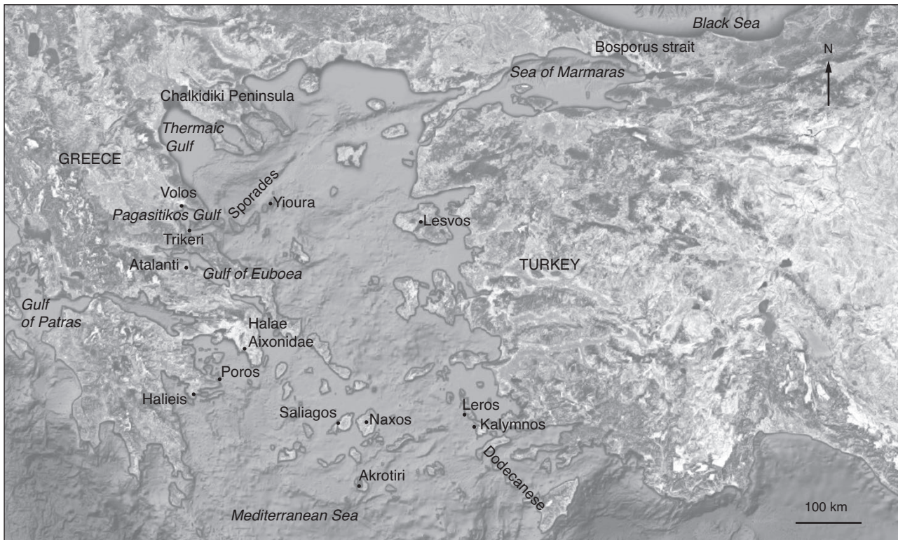
Fig. 1. — Map of the Aegean Sea with sites mentioned in the text noted on it. Credits: V. Triggas.