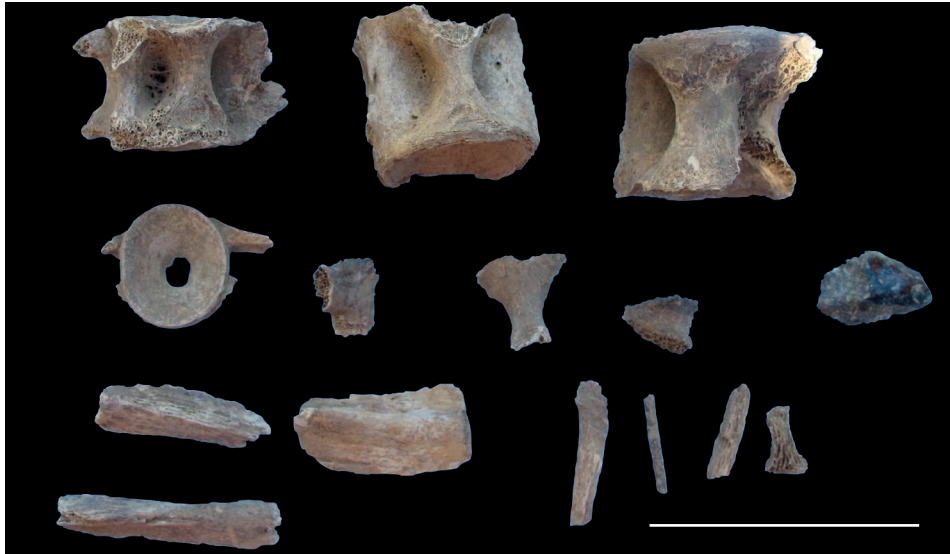
FIG. 2. — Thynnus sp. bones from Late Classical strata (400-300 BC) at Kalaureia, Poros island. Scale bar: 4 cm.

Sicily, Malta, Cyprus (Fromentin 2006), all well-known tuna-fishing areas in antiquity (Curtis 1991: 116-118, 129), as well as the Black Sea in the past (Piccinetti & Piccinetti-Marfin 1993). It usually occurs in May-June (Heinisch et al. 2008; Damalas & Megalofonou 2012). The exact spawning grounds, i.e., the locations towards which the reproduction migrations head, are still not well known. Bluefin tuna form dense schools on the reproductive leg of their migration and less dense ones after spawning and on their return trip to their feeding grounds. Young individuals feed mostly on zooplankton and older ones prey on schools of small pelagic fish and on cephalopods, such as squid (Sarà & Sarà 2007). Both juveniles and adults move through the water column; the older bluefin tuna can reach as deep as 500-1000 m (e.g., Brill et al. 2002). It is agreed that bluefin tuna tend to aggregate and feed along ocean fronts, where food availability is highest (Druon et al. 2011).