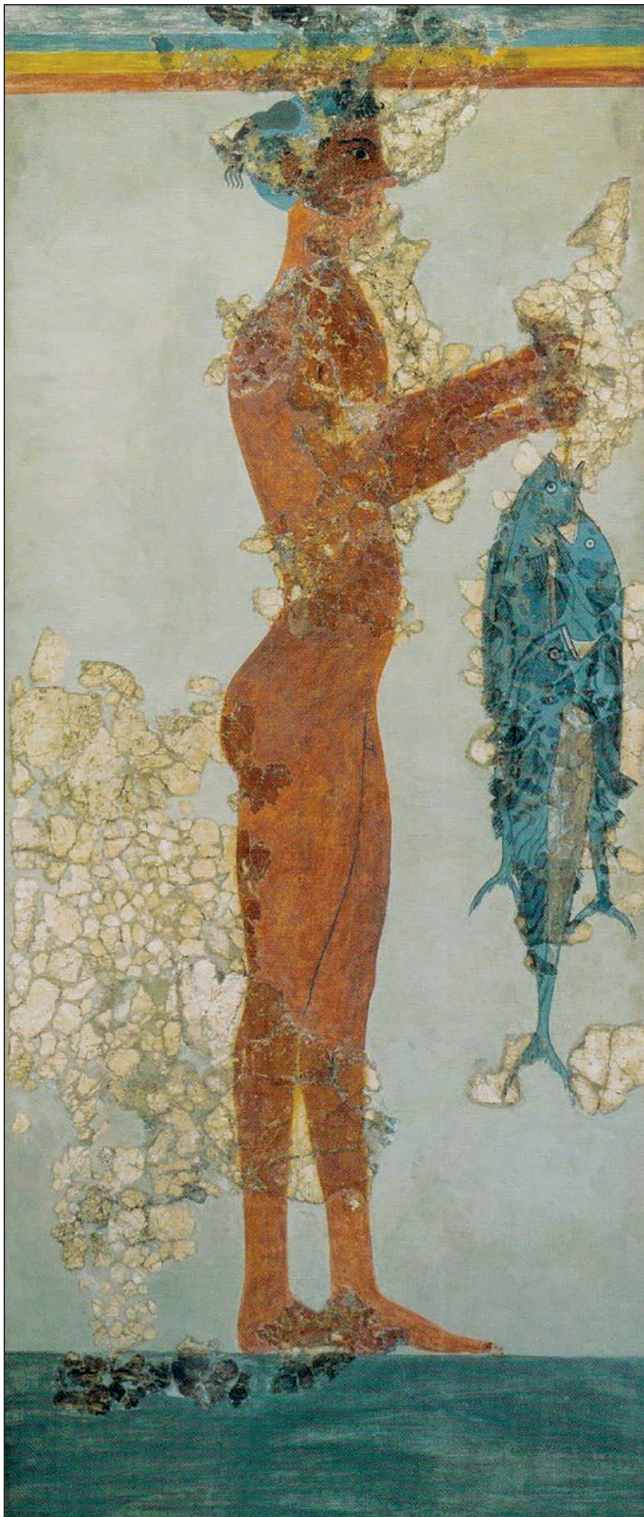
FIG. 4. — Wall painting of one of the two Little Fishermen from the so called West House at Akrotiri, Thera. The fish he holds are little tunny ( Euthynnus alletteratus Rafinesque, 1810) or bullet tunny ( Auxis rochei Risso, 1810) (reproduced from Dourmas 1992).

The “Little Fishermen” fresco illustrates the capture of seasonal fish, with two representative species that appear in the waters around the island at the same time of the year (Economidis 2000; Mylona 2000).