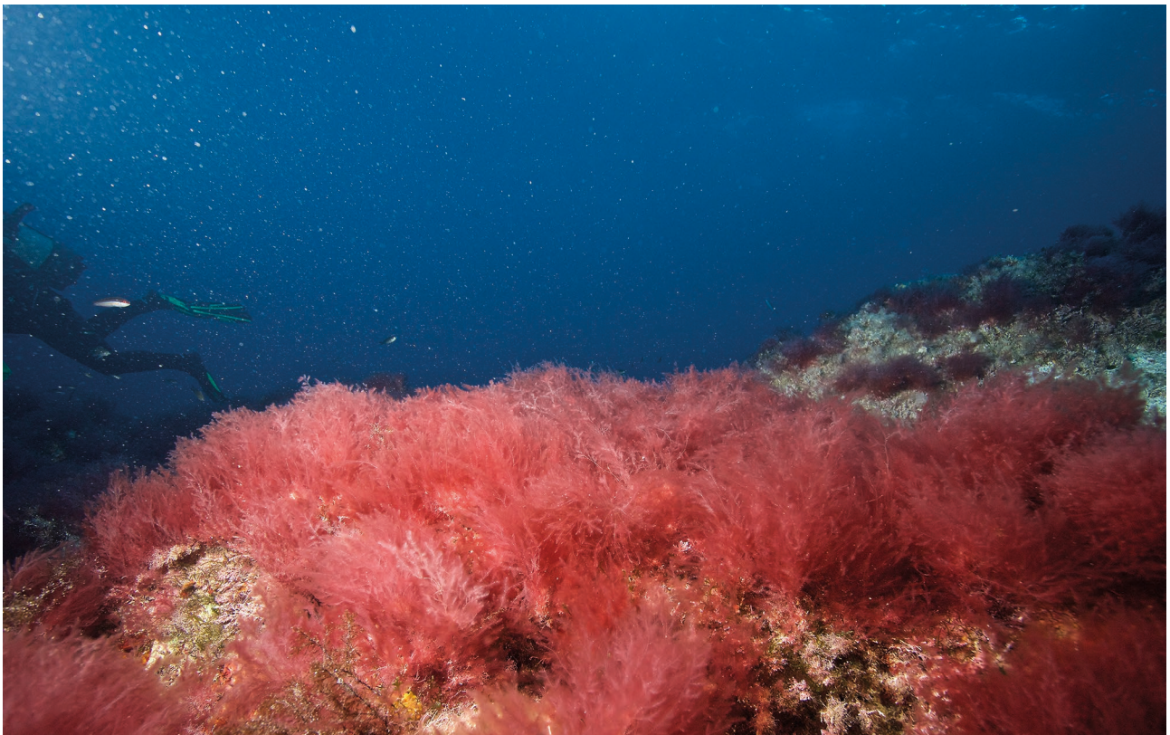
FIG. 2. — Lophocladia trichoclados (C.Agardh) F.Schmitz carpeting a rocky reef, 7 m depth, west side of La Gabinière Islet, Port-Cros National Park, eastern Provence, on November 27 th , 2022.