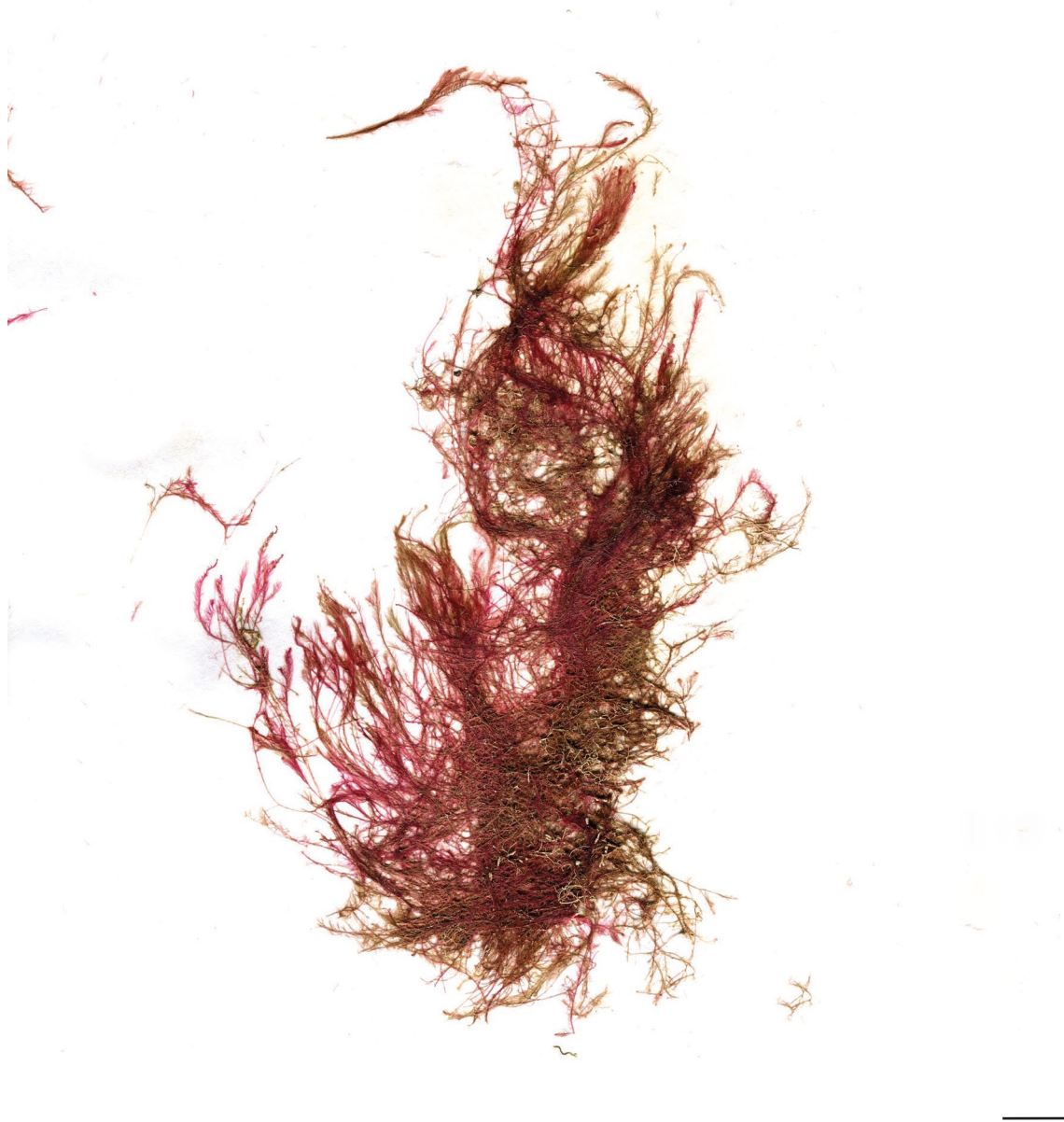
FIG. 4. — Lophocladia trichoclados (C.Agardh) F.Schmitz (as L. lallemandii (Montagne) F.Schmitz). Specimen H8345 (Marseille University Herbarium – HCOM). Collected in the Gulf of Ajaccio (Ajaccio) by Karine Lerissel on November 6 th , 2021. We have chosen not to modify the original label of the voucher. Scale bar : 1 cm.

(Balearic Islands), the mat of L. trichoclados (as L. lallemandii ) can become so thick and dense that new P. oceanica leaves are entrapped within the mat, display chlorosis and sometimes die, together with the shoots they are attached to (Ballesteros et al. 2007). Lophocladia trichoclados (as L. lallemandii ) is also a stress factor for the giant pen shell Pinna nobilis Linnaeus, 1758 (Box et al. 2008, 2009) and P. oceanica (Sureda et al. 2008). Lophocladia lallemandii is, however, a photophilic species that prefers shallow environments, decreasing its abundance in deep waters and showing almost no impact in deep water assemblages (Cebrian & Ballesteros 2007; Kersting et al. 2014).