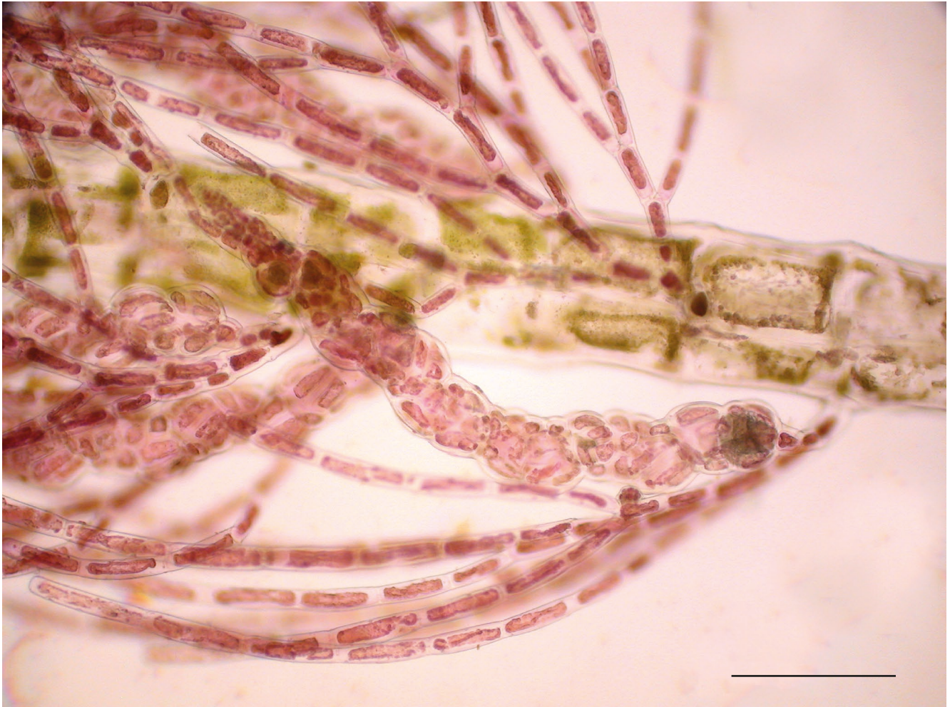
FIG. 3. — Portion of the axis of Lophocladia trichocladus (C.Agardh) F.Schmitz showing, on the bottom right side, the insertion of a twisted stichidium on the basal cell of a coloured trichoblast. From specimen H8344 (Marseille University Herbarium – HCOM). La Gabinière Islet, 6 m depth (December 15 th , 2021). in Boudouresque et al. (2022), as L. lallemandii (Montagne) F.Schmitz. Scale bar : 200 µm.

presented all the distinguishing characteristics of the taxon, as listed by Feldmann & Feldmann (1938), Rodríguez-Prieto et al. (2013), Verlaque et al. (2015) and Golo et al. (2024): 1) monopodial growth; 2) the branching exogenous, with branches replacing a trichoblast (replacing a trichoblast, or not: this character could be non-discriminant); 3) the axes with four pericentral cells; 4) the axial cell narrow in transverse section; 5) the segments short; 6) the trichoblasts coloured and persistent; and the tetrasporangial stichidia inserted on the basal cell of the trichoblast, slightly spirally twisted and with one tetrasporangium per segment (Fig. 3). Only the specimens dwelling at 9 m depth, on the west side of La Gabinière Islet, bore tetrasporangial stichidia.