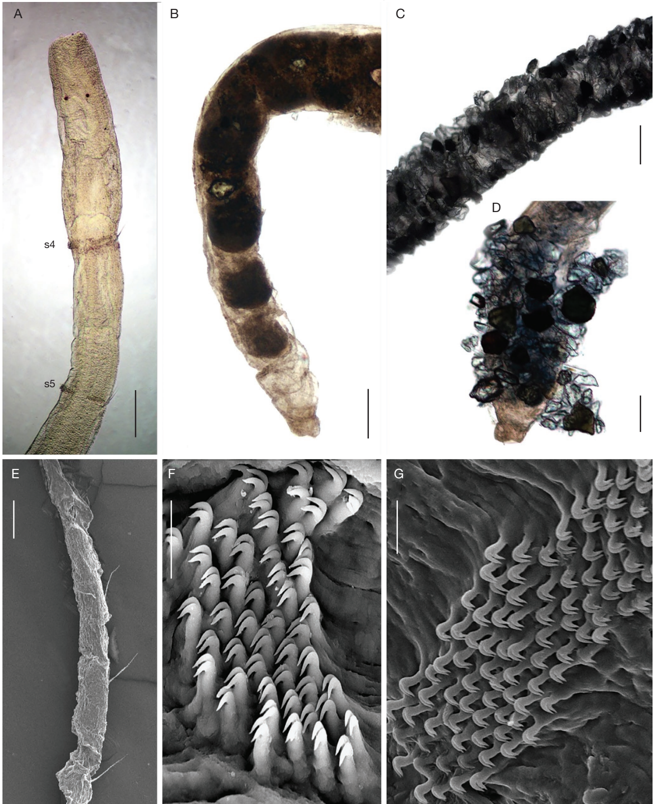
FIG. 2. — Galathowenia minuta n. sp. holotype, UMTAnn 2184: A , anterior end, dorsal view; B , posterior end, lateral view; C , grain sand cemented tube; midbody part; D , grain sand cemented tube; posterior end; E , posterior chaetigers with long capillary chaeta; lateral view; F , transverse rows of hooked uncini; mid body; G , hooked uncini in oblique position mid body. Abbreviation: S , segment. Scale bars: A, B, 200 \mu m; C, D, E, 100 \mu m; F, G, 10 \mu m.