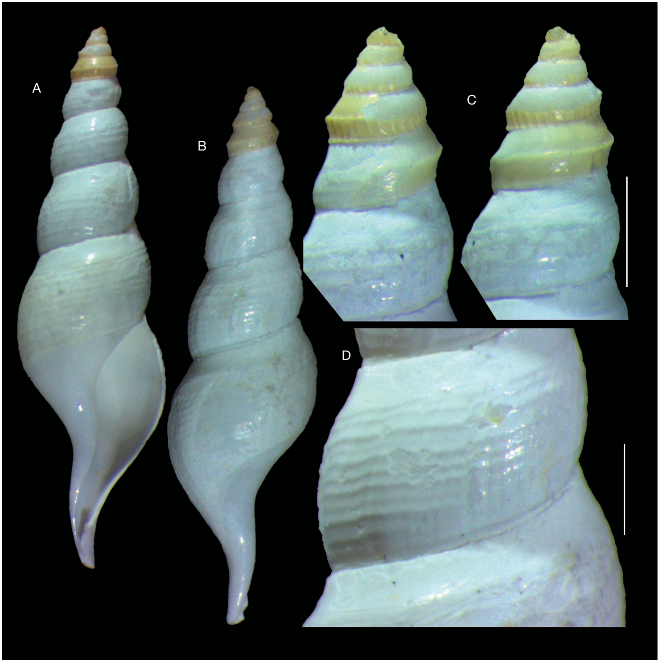
FIG. 4. — Shell of Famelica pukua n. sp. holotype MZSP 116406: A , frontal view (L 8.8 mm); B , dorsal view; C , apex, two views; D , detail of penultimate whorl. Scales bars: 0.5 mm.

ences can be evoked, convincing that the samples from the North and from the South Atlantic belong to different species. F. leucospira n. sp. has a carinate protoconch, in which carina is much broader than the inferior suture (Figs 2A-C, F, I; 3C, F-I) (Figueira & Absalão 2012: figs 4); no carina is present in F. mirmidina 's protoconch; additionally, its protoconch apparently is much richer sculptured, while that of F. mirmidina has only a spaced reticulate (Fig. 3C, D, F-I). The spire of F. leucospira n. sp. is wider, with spire angle 35-40°, and has a uniform growth; while that of F. mirmidina is narrower, with spire angle of 28-30°, and is slightly wider in the base of the