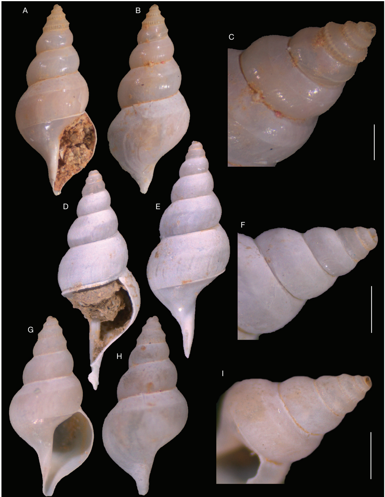
FIG. 2. — Shells of Famelica leucospira n. sp. type specimens: A-C , holotype MNHN-IM-2000-38590 (L 5.1 mm), frontal view ( A ), dorsal view ( B ), detail of apical region ( C ); D-F , paratype MNHN-IM-2000-38591 (Sta. DS05) (L 4.6 mm), frontal view ( D ), dorsal view ( E ), detail of apical region ( F ); G-I , paratype MZSP 157439, (L 6.8 mm), frontal view ( G ), dorsal view ( H ), detail of apical region ( I ). Scale bars: C, F, I, 0.5 mm.