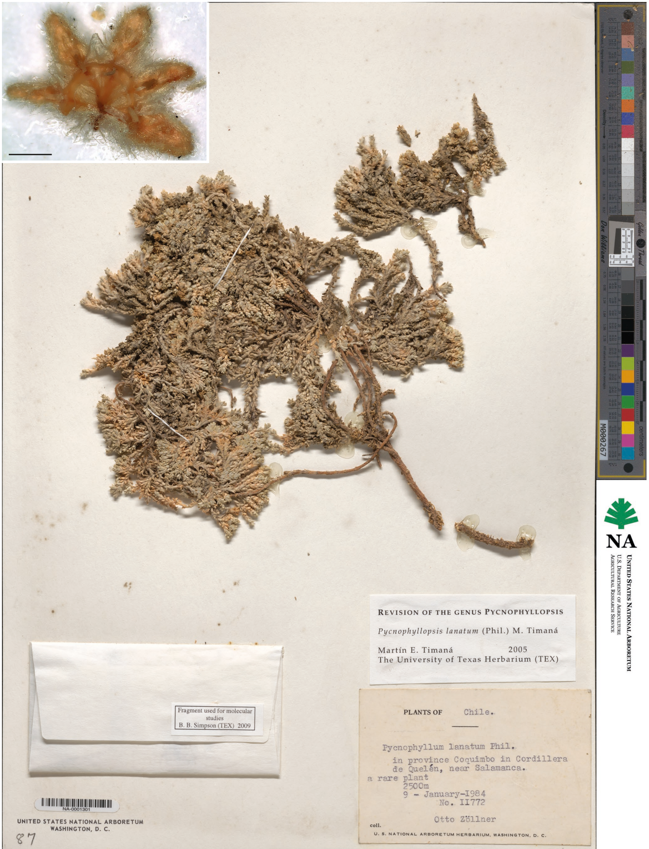
FIG. 2. — Baretia lanata (Phil.) Timaná, comb. nov., O. Zöllner 11772 (NA 0001301). Inset: Flower close-up, O. Zöllner 11772 (MO346208). Scale bar: 1 mm.