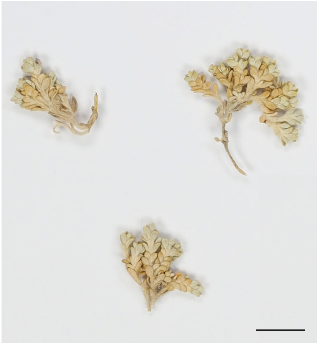
FIG. 3. — Baretia lanata (Phil.) Timaná, comb. nov. Close up of terminal branches, Teillier & Torres-Mura 8034 (CONC 182760). Scale bar: 1 cm.