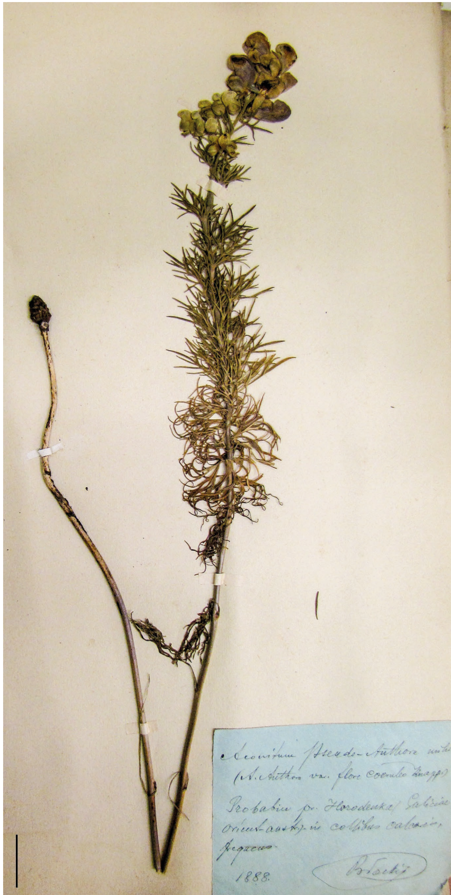
FIG. 1. — Voucher of Aconitum var. flore coeruleo [sic] collected by Blocki in 1888, deposited in WU. Scale bar: 2 cm.