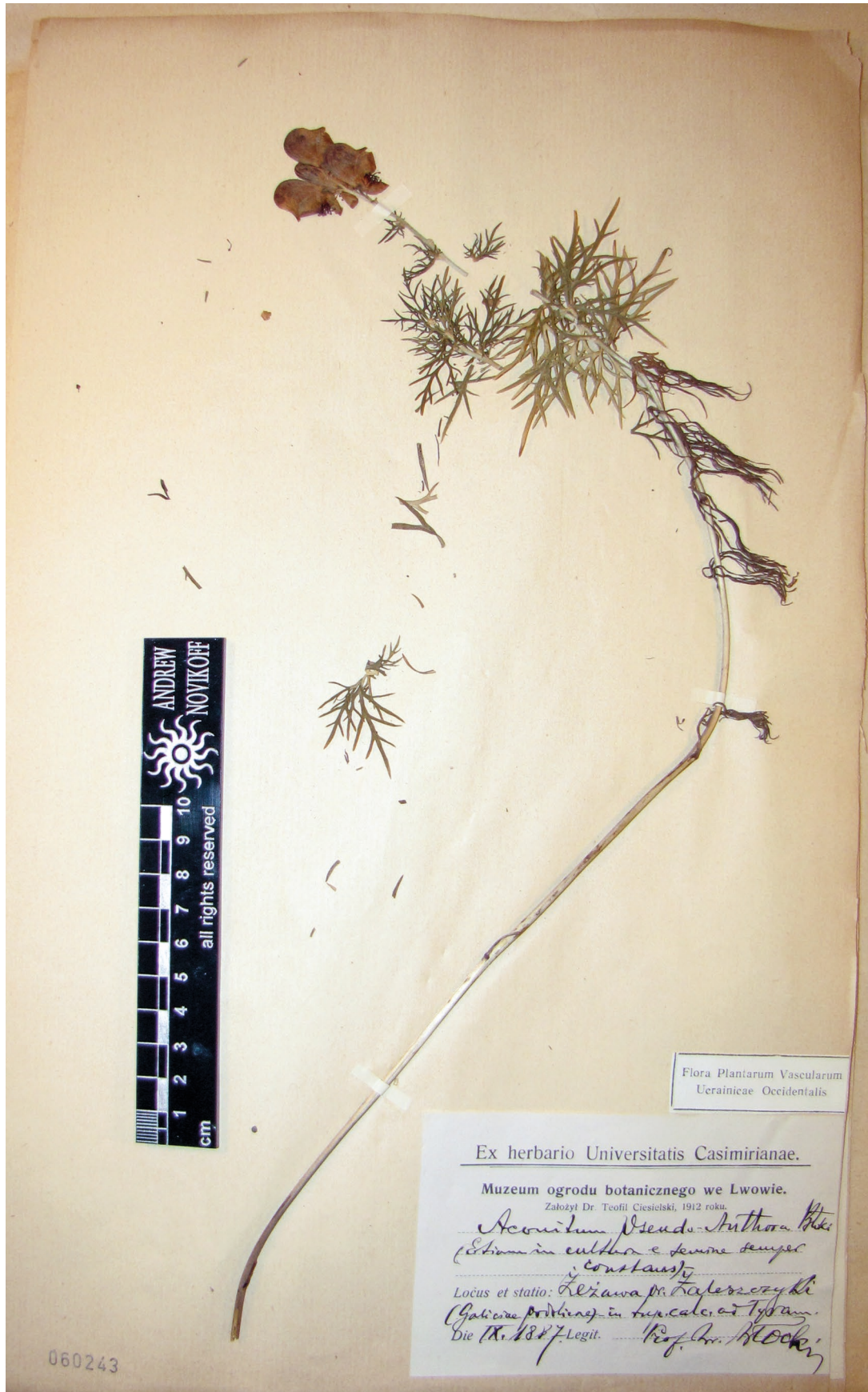
FIG. 4. — Neotype of Aconitum tenuisectum Schur (LW060243).