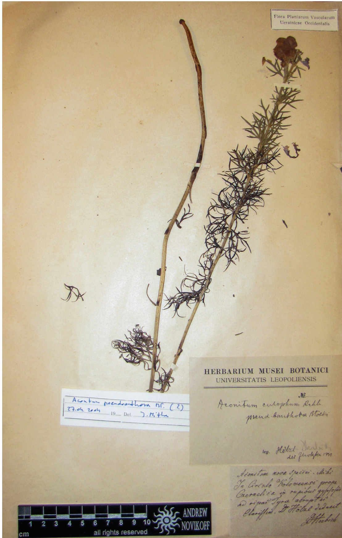
FIG. 2. — Neotype of Aconitum anthora subsp. coeruleum (Blocki) Novikov & Mitka, stat. nov. Herbich (LW).