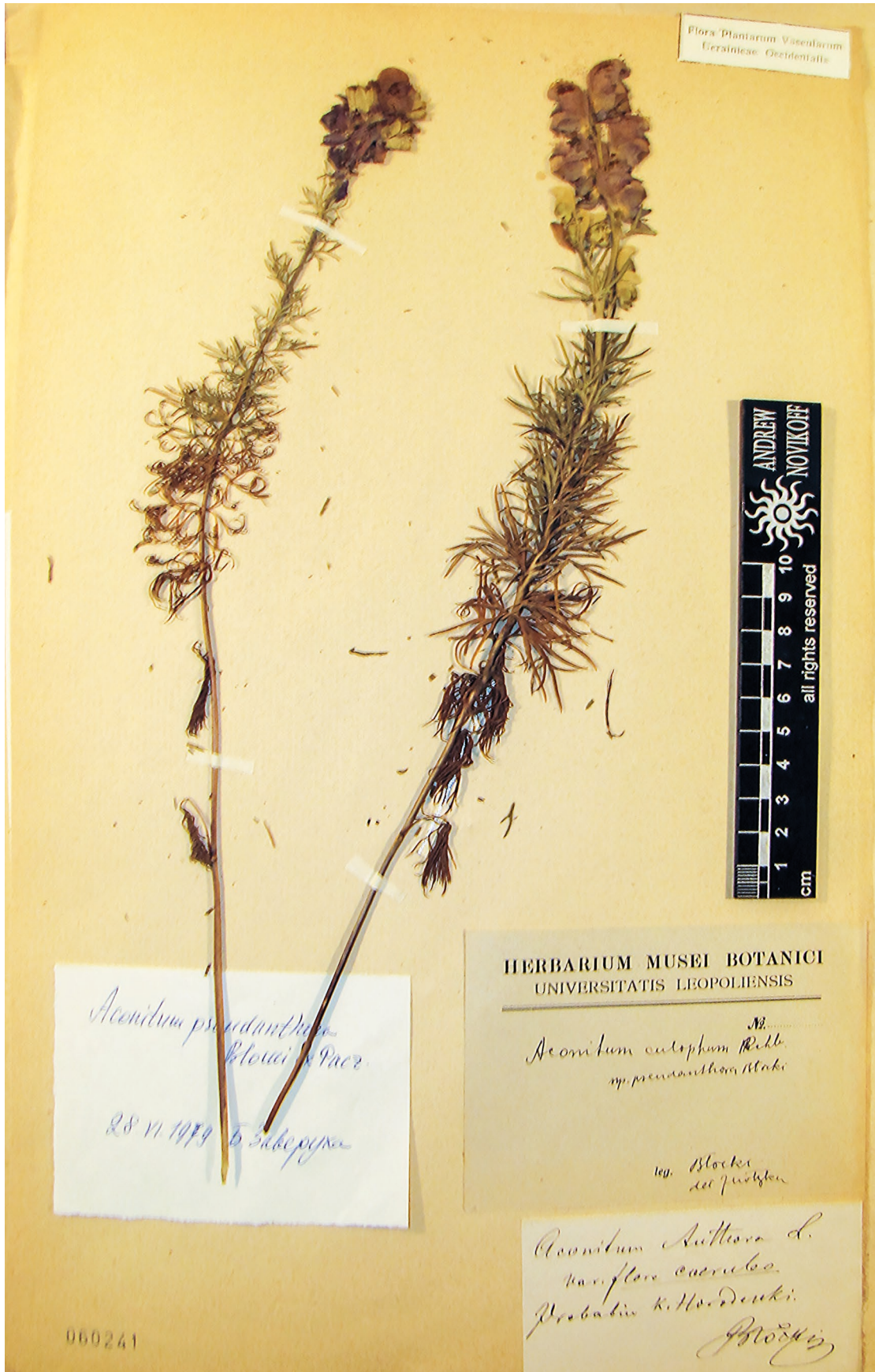
FIG. 5. — Isoneotype of Aconitum anthora L. subsp. coeruleum (Blocki) Novikov & Mitka, stat. nov. (LW060241).