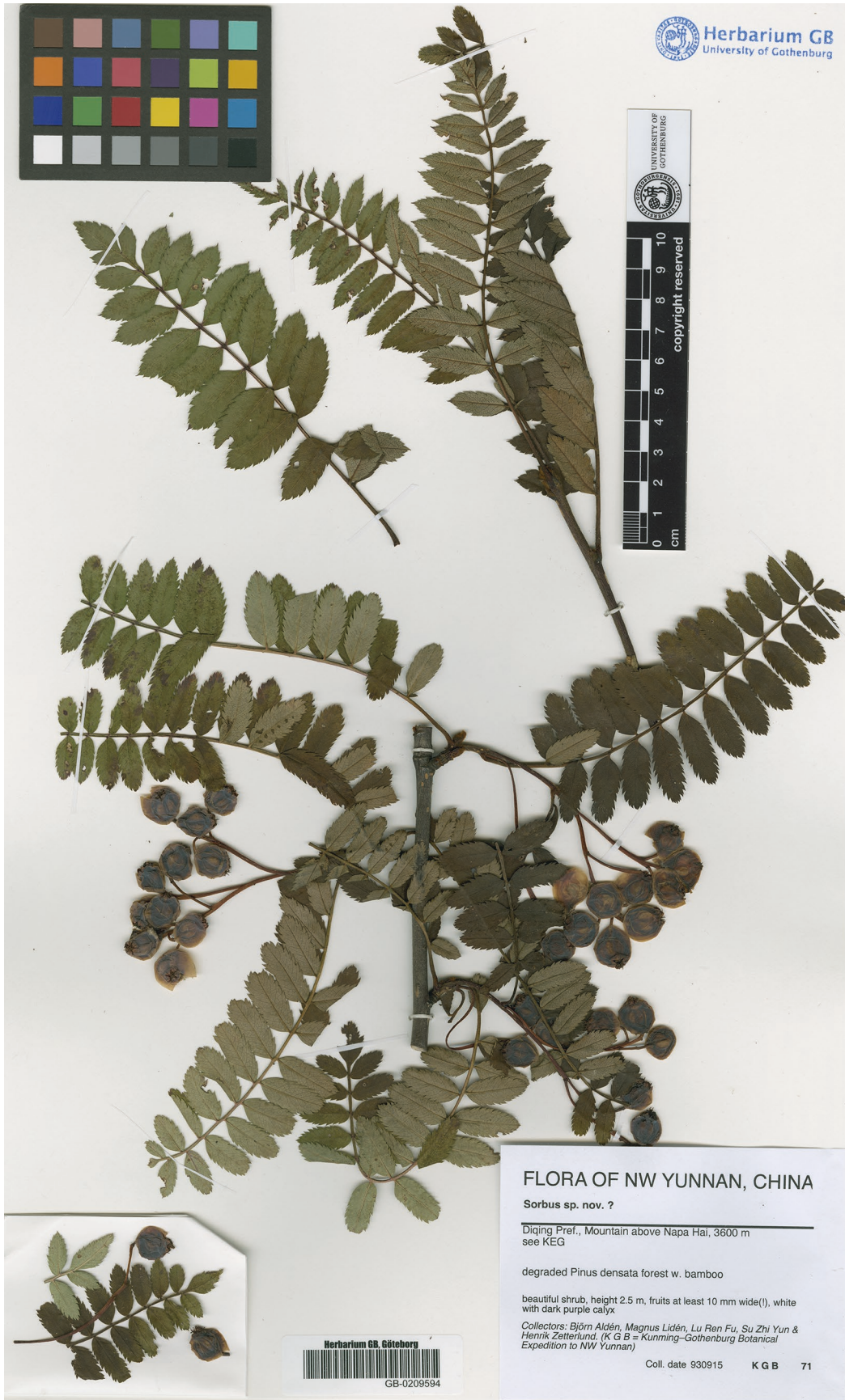
FIG. 2. — Holotype of Sorbus erythrosepala sp. nov. (GB-0209594), reproduced with permission from Herbarium GB.