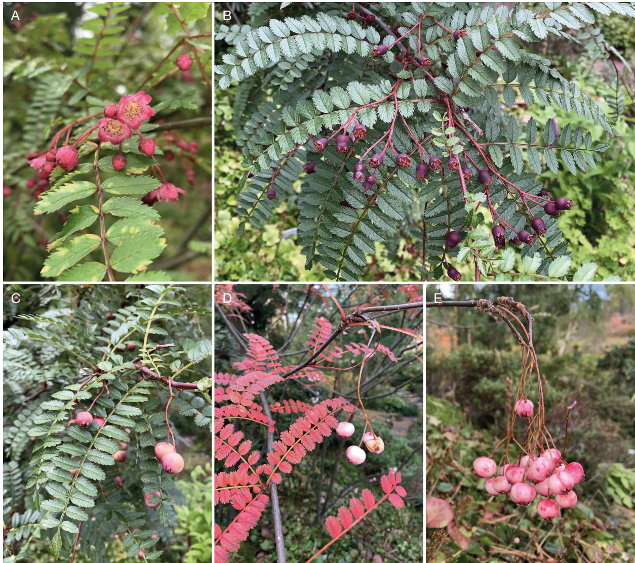
FIG. 4. — Sorbus filipes Hand.-Mazz., photos of cultivated material (KGB 72) at Gothenburg Botanical Garden: A , flower buds and open flowers; B , C , immature fruits; D , E , pendulous infructescences with ripe fruits.