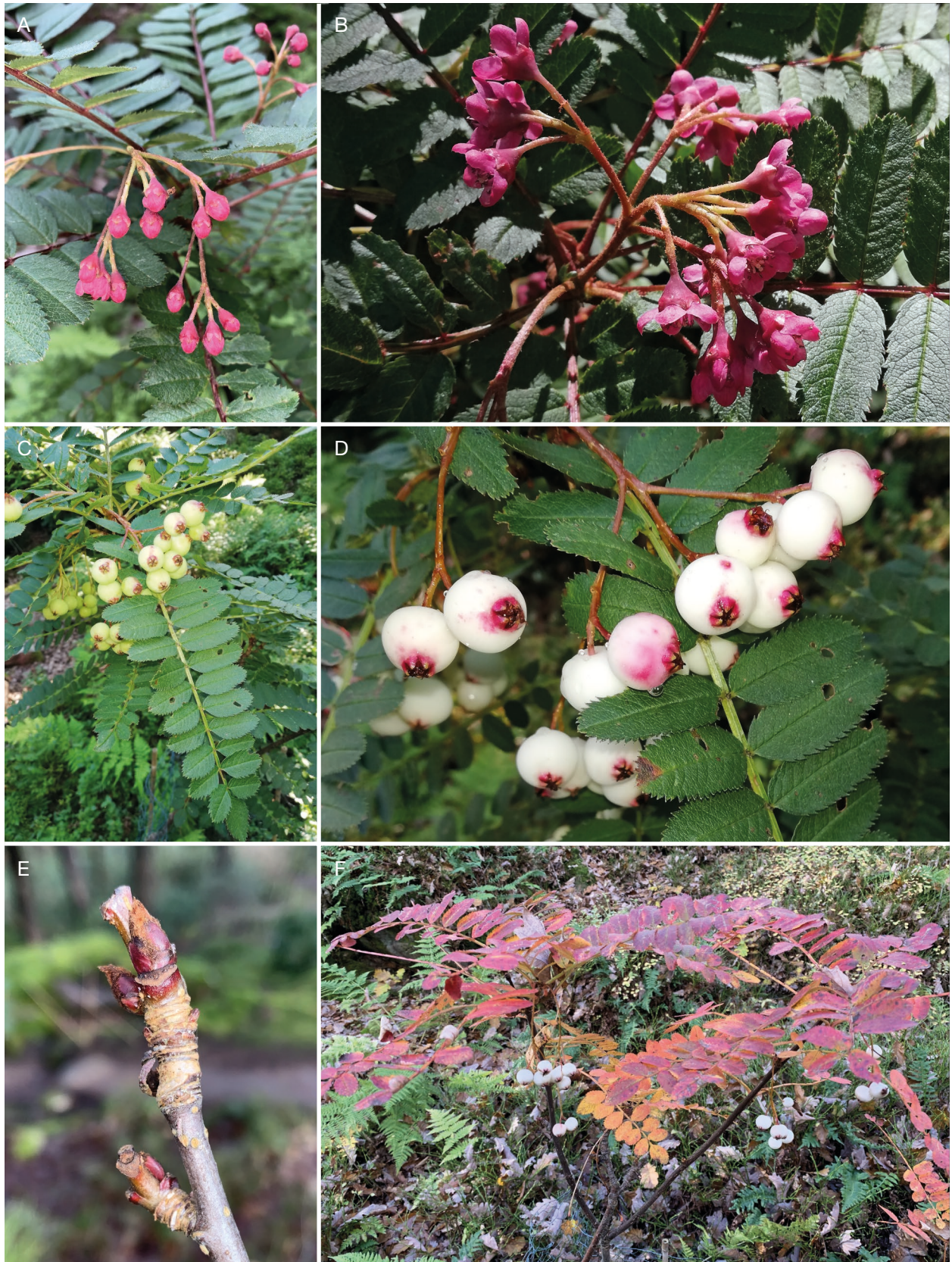
FIG. 3. — Sorbus erythrosepala sp. nov., photos of cultivated material (KGB 71) at Gothenburg Botanical Garden: A , flower buds; B , open flowers; C , branch with immature fruits; D , ripe fruits; E , buds; F , shrub in autumn colours with pendulous infructescences.