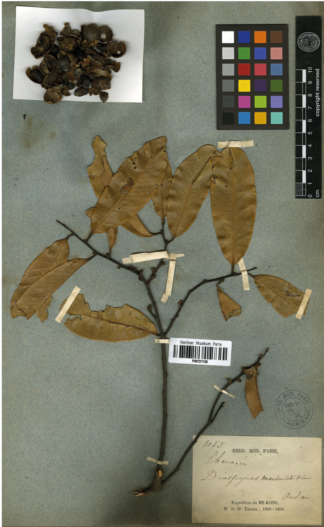
Fig. 4. — Lectotype of Diospyros susarticulata Lecomte, Thorel 2055 (P00721745).