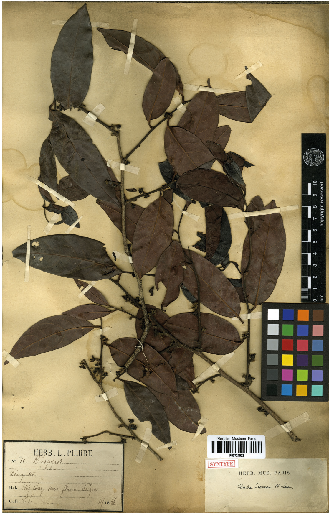
FIG. 5. — Lectotype of Maba pierrei Lecomte, Pierre 11 (P00721572).