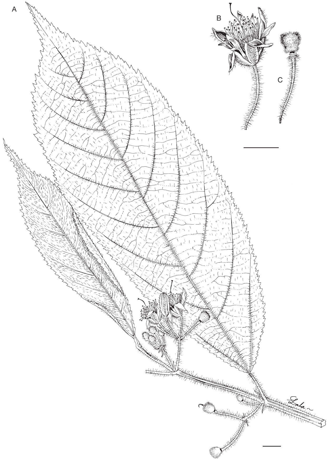
FIG. 1. — Grewia hispidissima Wahlert, Phillipson & Mabb., sp. nov.: A , flowering branch; B , flower; C , immature fruit. A-C , Service Forestier (Capuron) 11397 (holotype P[P00375156]). Drawn by Roger Lala Andriamiarisoa. Scale bars: 1 cm.