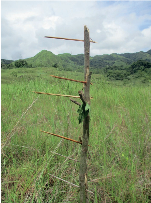
FIG. 5. — Customary marker indicating distance and number of balatik (spear-trapping) near the trail. Each arrow represents a spear-trap and its distance from the trail. When the arrow points a little upward, it means the trap is far from the trail.