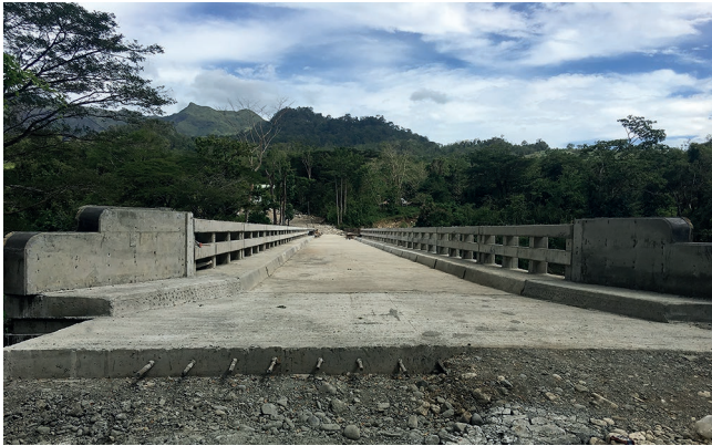
FIG. 1. — This concrete bridge replaced a hanging bridge as part of the State modernization plan for the Mounts Iglit-Baco Natural Park. For many Tau-Buhid, the concrete bridge represents a denial of their legal and customary rights within and over the extent of their lands, and is a threat to the survival of their way of life. Through this bridge, State surveillance and control of highland activities intensified.