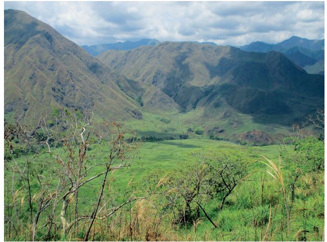
FIG. 6. — Sagrado (sacred place) at the foot of Mount Talafu, east (right) and west (left).

Sagrado is a plateau of more or less a hundred hectares located near the foot of a sacred mountain called Talafu (Fig. 6). As noted earlier, mountains are regarded as beings who nurture the spirits residing there. Here, while sagrado serves as a sanctuary to all the AFS and other spirits, Mount Talafu is home of the ancestors. Humans reside outside these places, and access to these areas, especially to the mountain, is restricted even among Tau-Buhid.