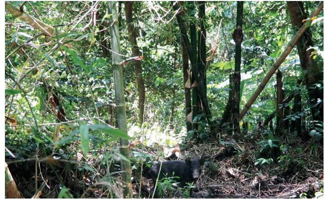
FIG. 2. — Black swine believed to have turned feral near Mount Iglit (Buksol Mangibok for the Tau-Buhid).

freely around the park, fending for themselves. In time, they became pests, destroying lowland swiddens and contaminating natural springs used for potable water. This scenario, as recounted by my informants, coincides with reports from conservationists, who, in meetings, added that domesticated pigs, like the one shown in Figure 2, had slowly interbred with the warty pigs, compelling the DENR to enforce an even stricter prohibition of bringing pigs into the highlands. This outcome could have been prevented if there were prior consultations with the highlanders, who used to keep a minimal number of pigs in small enclosures under their houses solely for ritual purposes.