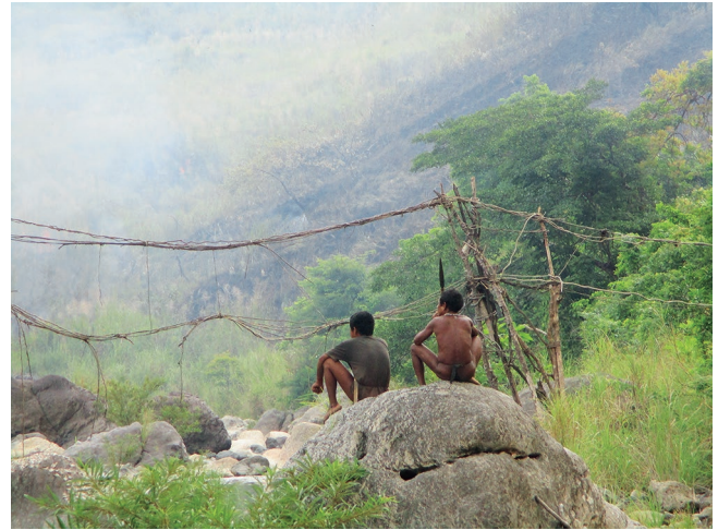
FIG. 10. — Men from middle and highland regions waiting for the rain to pour down. The man on the left (wearing a shirt) may witness the process but cannot join directly in the activity because he is from the middle region (near Mount Iglit). As of this writing, only secluded highland communities may join in burning the sagrado (sacred place).

biological world. In other words, for the Tau-Buhid, the physical realm and the spiritual dimension are not distant worlds; rather, these worlds co-exist and augment each other to sustain forest life.