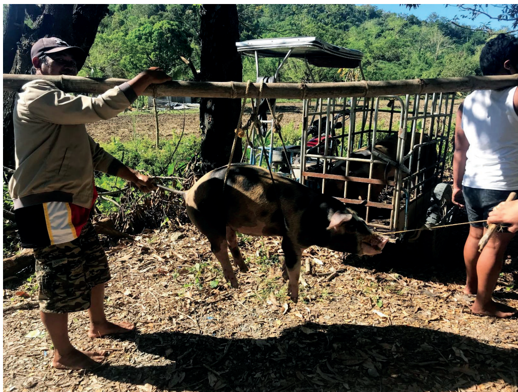
FIG. 3. — Siganon (lowlanders) swine traders who supply pork in the local market and occasionally exchange pigs for swidden-grown rice with highlanders.

tree called awyan or almuyo . This bark, after being beaten several times, turns into fibrous covering used by both men and women (Quizon & Magpayo-Bagajo in press). Children remain naked. But representatives from secluded communities use gime made of cloth, and upon return to the highland, change into ones made from bark. To maintain a collectively enforced isolation, only community representatives are allowed to go downhill. They are those who acquire names from the Tagalog.