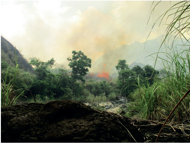
FIG. 9. — Safong (circular burning) fully initiated.