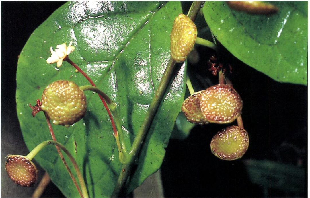
Fig. 2.— Ehippiandra masoalensis Lorence, photo of Schatz et al. 2787 showing staminate flower at anthesis and discoid pistillate flowers.

DISTRIBUTION AND HABITAT.— Ehippiandra masoalensis is known only from the type locality on the Masoala Peninsula, Madagascar, where it was collected in lowland tropical evergreen wet forest at 380 m elevation.